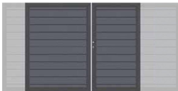
double swing gates