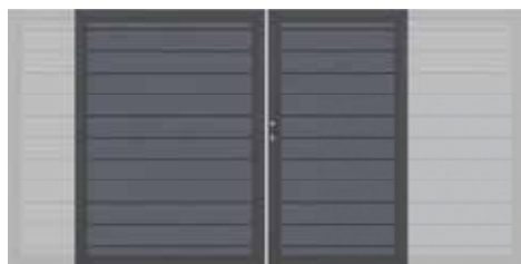
double swing gates