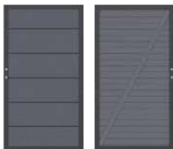
single swing gates