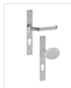
Handle & doorknob