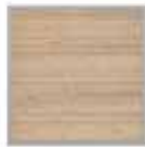
HoriZen Composite Alu Design sand