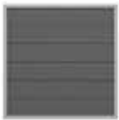
HoriZen Composite Alu Design anthracite